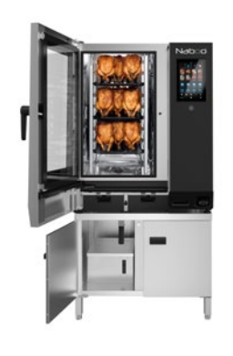
(2) must be requested at